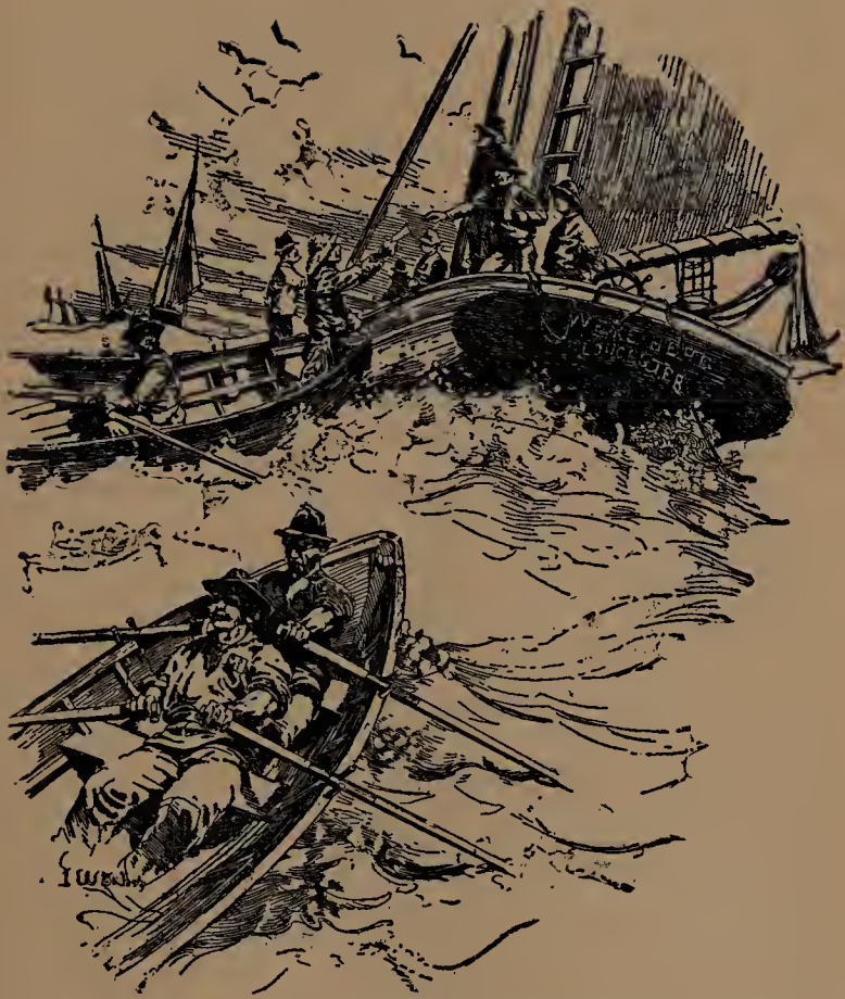
"DORIES CAME ALONGSIDE WITH LETTERS FOR HOME."